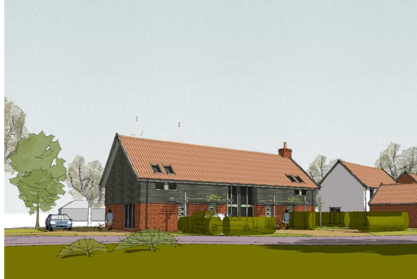
Perspective view from entrance to development