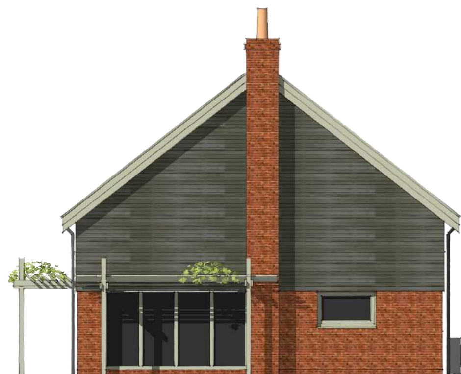
South 1:100 Elevations