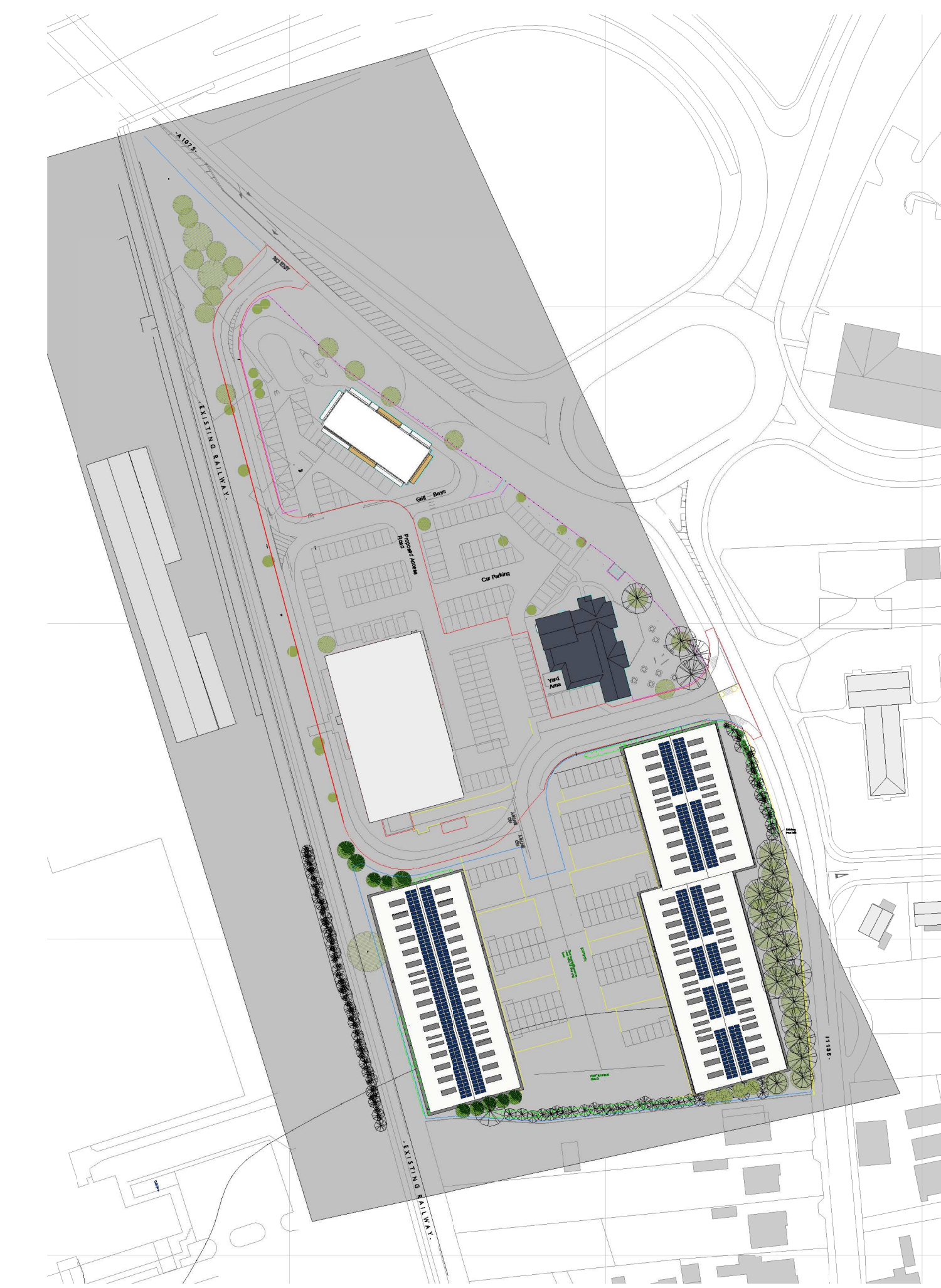
Section Plan Scale: 1:1500

0m 5m 10m 15m 20m 25m VISUAL SCALE 1:250 @ A1