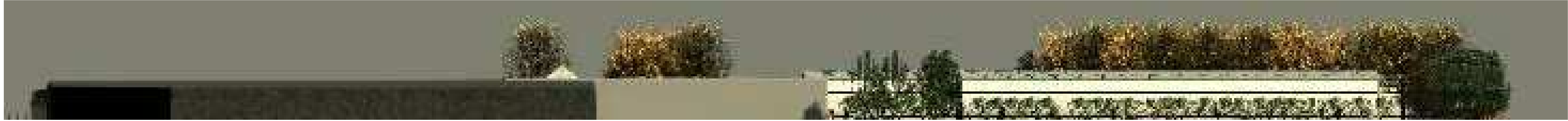
West Elevation Scale: 1:1