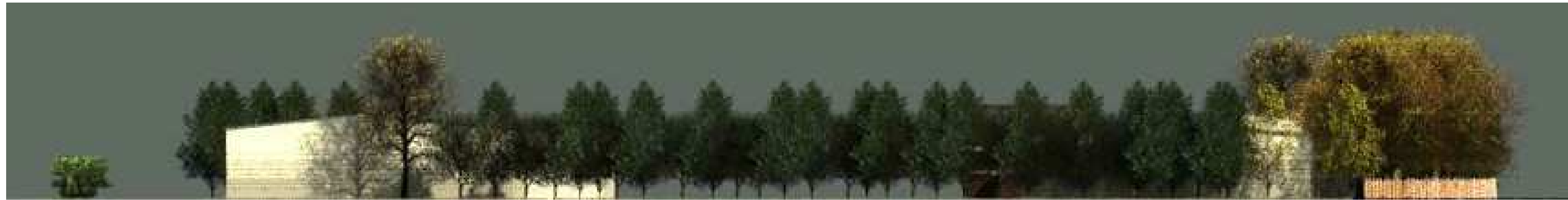
South Elevation Scale: 1:1