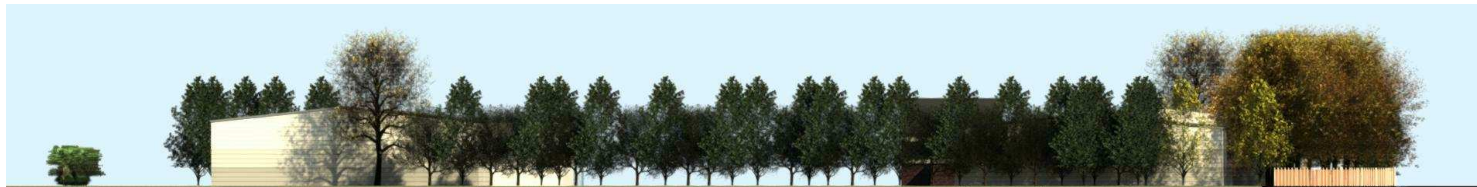
6 South 1:1