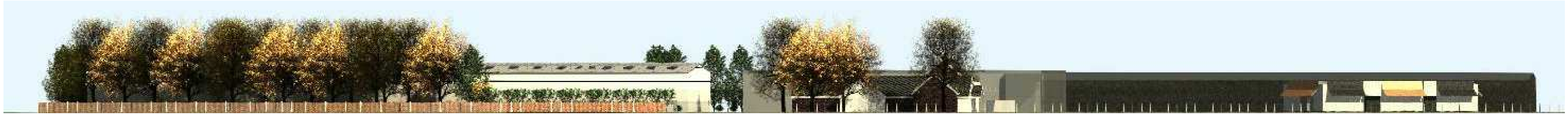
East Elevation Scale: 1:1